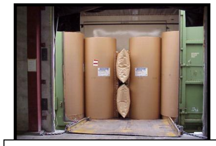
Exempt from doorway protection